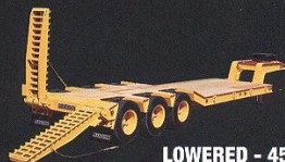
LOWERED - 45t