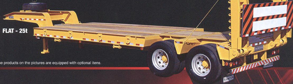
FLAT - 25t

The products on the pictures are equipped with optional items.