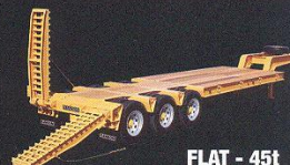
FLAT - 45t